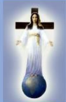
Mary, Be Our Advocate

"My Soul Magnifies the Lord, My Spirit Rejoices in God My Saviour" – Luke 1:46-47