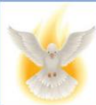
Come Holy Spirit

"My Soul Magnifies the Lord, My Spirit Rejoices in God My Saviour" – Luke 1:46-47