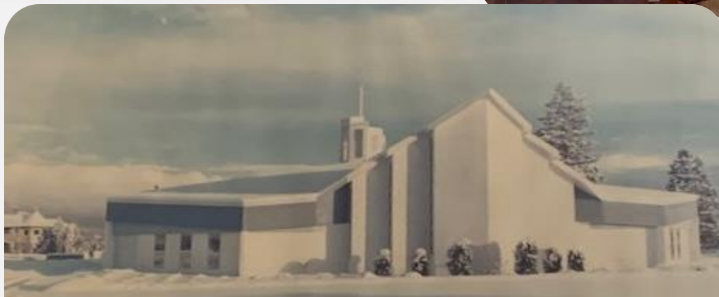
CHURCH OF THE HOLY CHILD ON ROSEDALE AVENUE, 1988- present