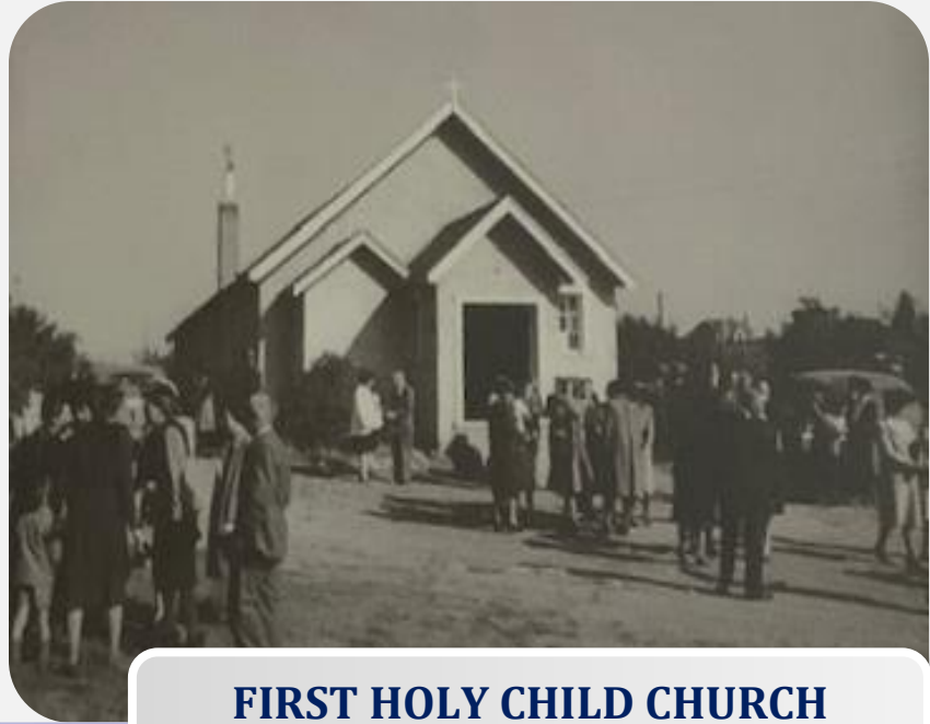
FIRST HOLY CHILD CHURCH ON JULIA STREET, 1928-1948

CELEBRATION IS ON JUNE 11, 2023, 10 AM, SUMMERLAND MEMORIAL PARK.