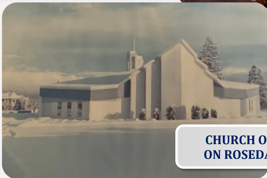
CHURCH OF THE HOLY CHILD ON ROSEDALE AVENUE, 1988-