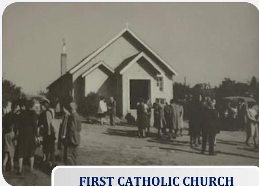
FIRST CATHOLIC CHURCH ON JULIA STREET, 1928-1948

CELEBRATION IS ON JUNE 11, 2023, 10 AM, MEMORIAL PARK.