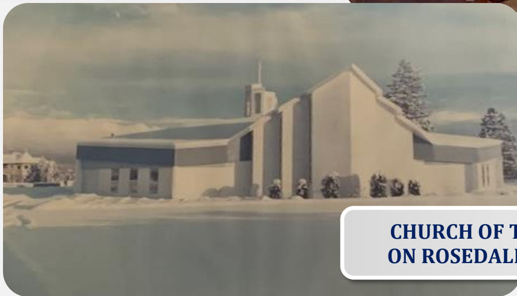
CHURCH OF THE HOLY CHILD ON ROSEDALE AVENUE, 1988-