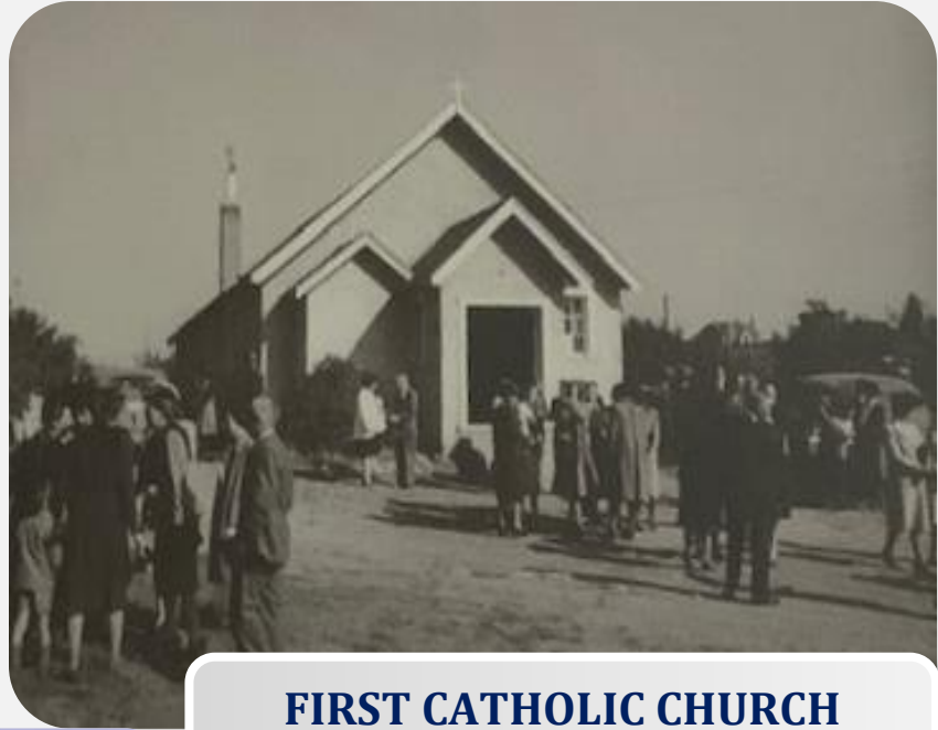
FIRST CATHOLIC CHURCH ON JULIA STREET, 1928-1948

CELEBRATION IS ON JUNE 11, 2023, 10 AM, MEMORIAL PARK.