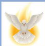
Come Holy Spirit

First Reading: Songs 3 : 1-4b or Second Corinthians 5 : 14-17 Gospel: John 20 : 1-2, 11-18