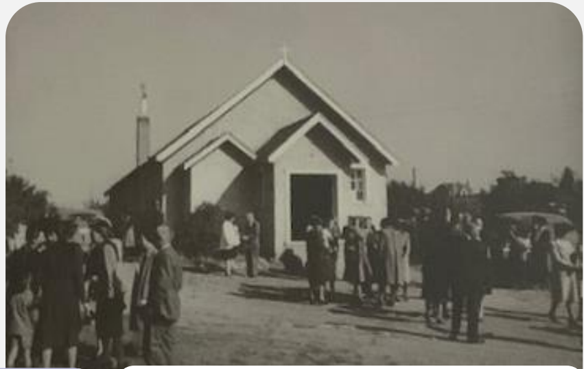
FIRST CATHOLIC CHURCH ON JULIA STREET, 1928-1948

HOLY CHILD PARISH IS CELEBRATING 75 YEARS THIS YEAR. IT WAS ESTABLISHED as a PARISH IN 1948. MAY GOD CONTINUALLY BLESS OUR COMMUNITY! We praise! We thank! We celebrate! CELEBRATION IS IN JUNE.