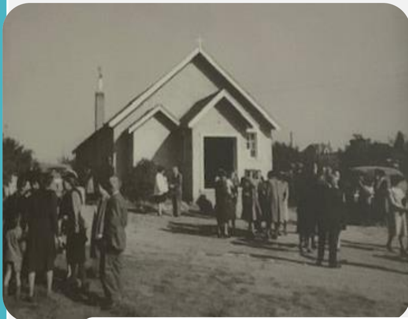
FIRST HOLY CHILD CHURCH JULIA STREET, 1928-1948

CELEBRATION IS ON JUNE 11, 2023, 10 AM, SUMMERLAND MEMORIAL PARK.