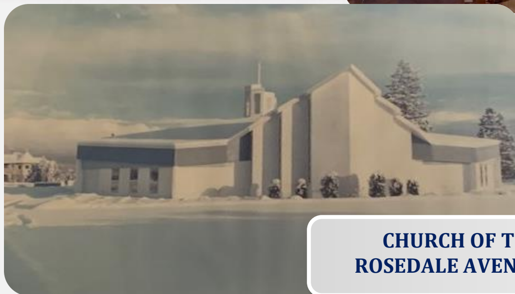
CHURCH OF THE HOLY CHILD ROSEDALE AVENUE, 1988 - present