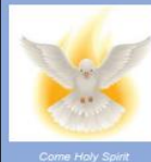
Come Holy Spirit

"My Soul Magnifies the Lord, My Spirit Rejoices in God My Saviour" – Luke 1:46-47