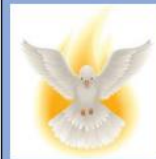
Come Holy Spirit

"My Soul Magnifies the Lord, My Spirit Rejoices in God My Saviour" – Luke 1:46-47