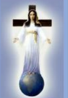
Mary, Be Our Advocate

"My Soul Magnifies the Lord, My Spirit Rejoices in God My Saviour" – Luke 1:46-47