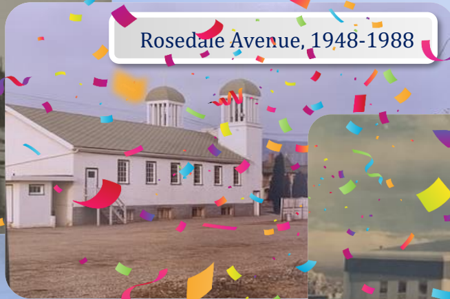
Rosedale Avenue, 1948-1988