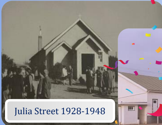
Julia Street 1928-1948

Mass will be followed by fellowship with BBQ food and beverage provided. Please bring a lawn chair. We look forward to welcoming all of you at Memorial Park to celebrate this momentous event in our parish.