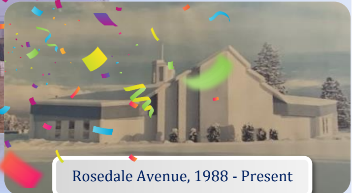
Rosedale Avenue, 1988 - Present

Holy Child parish is celebrating 75 years as a parish, 95 years as a community! May God continually bless our community! We praise! We thank! We celebrate!